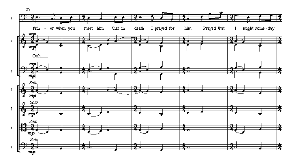
(measures deleted -- sample excerpt only)